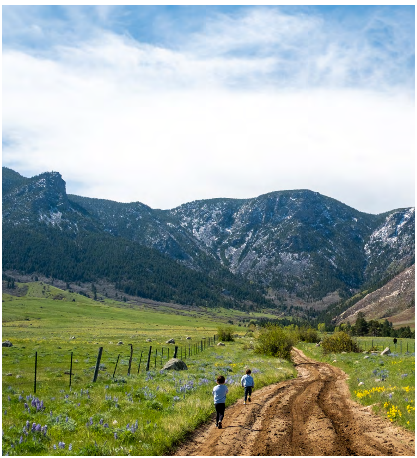
Little Goose Canyon